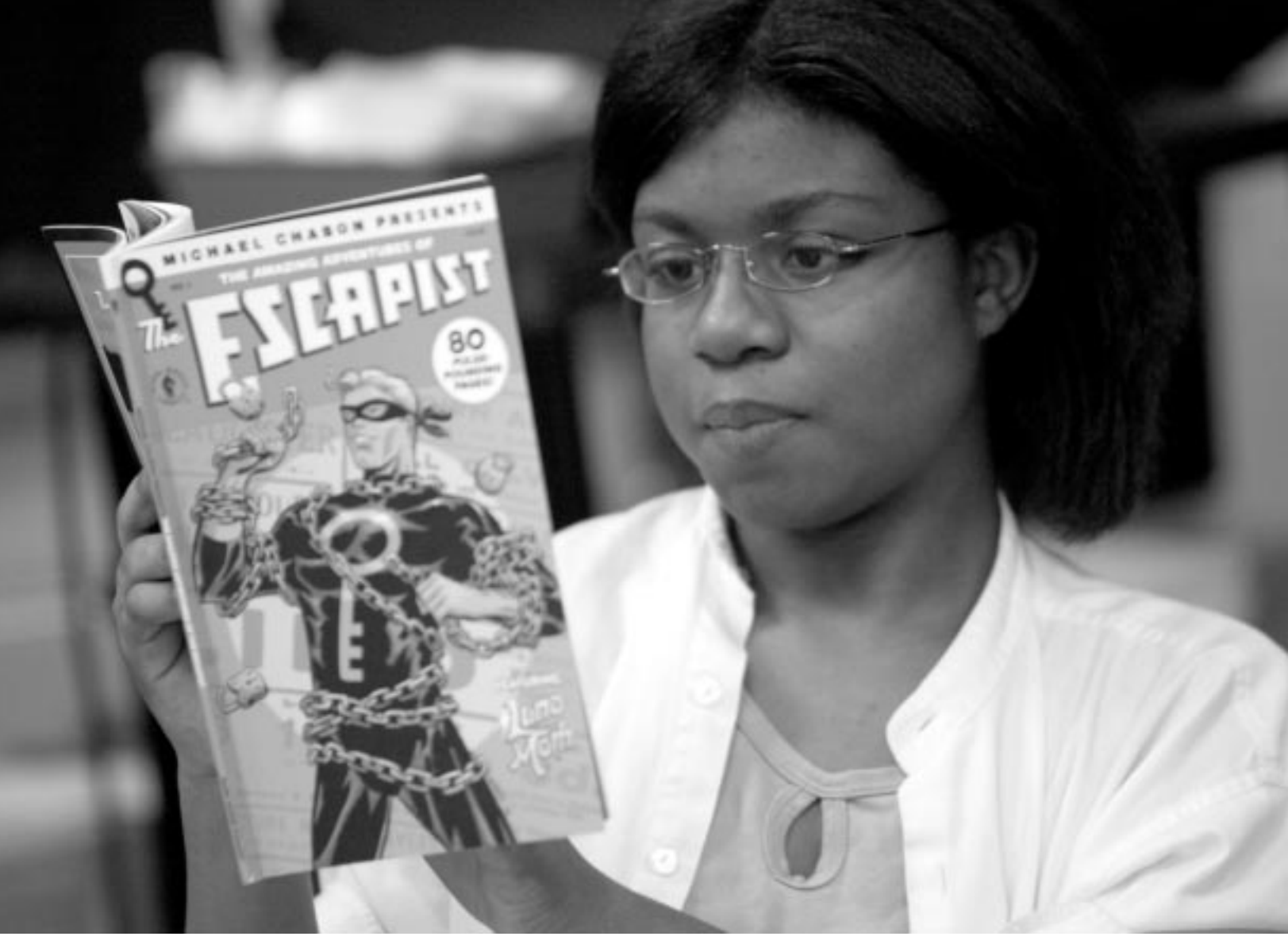
StreetSquash Book Club

theory suggests that afterschool programs can improve student school performance by focusing on the youth themselves. Those who design afterschool programs might consider using the features of effective learning environments outlined in socio-cultural theory as their primary research-based program guide.