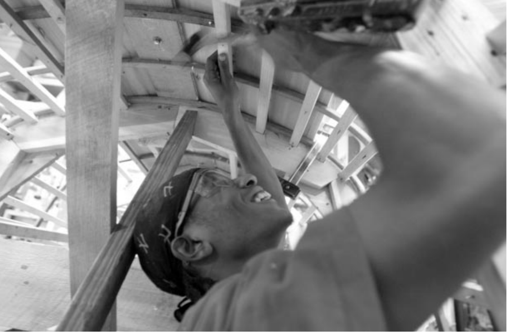
Rocking the Boat

Kim, Lee, & Baker, 2000). Likewise, one feature of promising programs in a national review of such programs in low-income schools is the extent to which programs were tailored to individual student interests and needs (Meehan, Cowley, Chadwick, Schumacher, & Hauser, 2004; Policy Studies Associates, 1995). An afterschool program in Seneca, Missouri, incorporates state learning objectives into programs but allows youth interests, rather than the standards, to drive choices of activities. For example, program directors ask students to sign up for classes in activities they "love," such as cake decorating. "Once an activity is chosen, the teacher examines the list of state goals to find out which ones can be incorporated into the class. Then we find a way to get the state learning objectives into the course" (Yost, 1999, p. 3). Reflecting the importance of building on youth interests, the U.S. Department of Education argued that quality afterschool programs "give children the opportunity to follow their own interests or curiosity, explore other cultures, develop hobbies, and learn in different ways such as through sight, sound, and movement" (U.S. Department of Education [U.S. DOE] & U.S. Department of Justice [DOJ], 1998, p. 35).