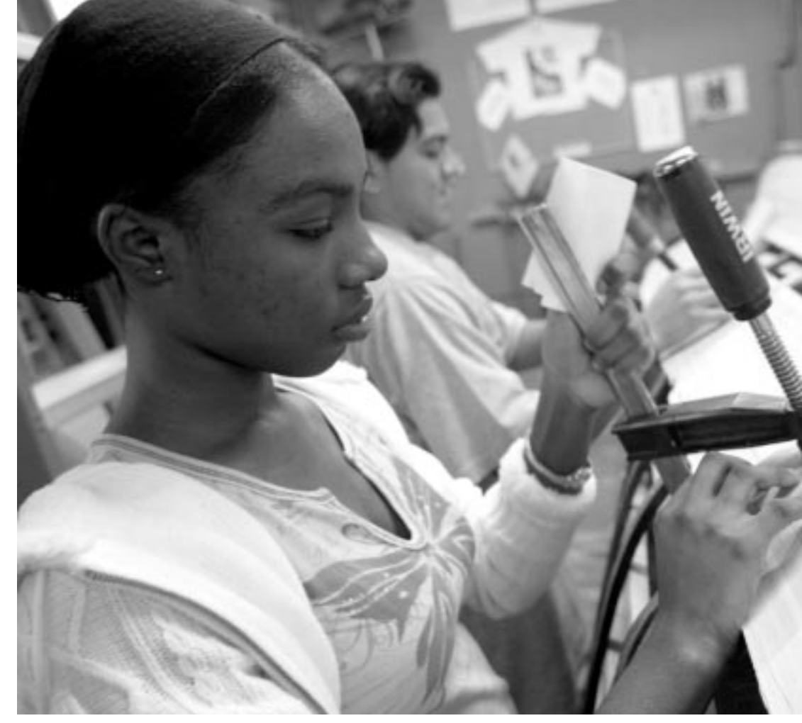
Rocking the Boat

Of the original 199 documents, we identified 108 that addressed these learning outcomes either directly or in combination with other study documents; we included papers that did not themselves report learning outcomes but described the components of programs whose outcomes were reported in other documents. This first pass revealed the equivocal findings summarized above, which provided the basis for our